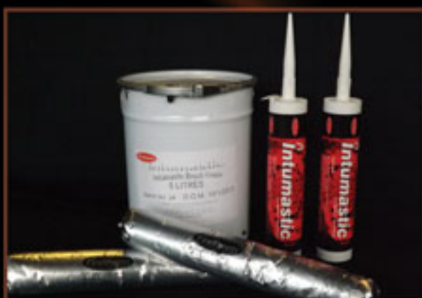
Available in Tube, Sausage or Tub