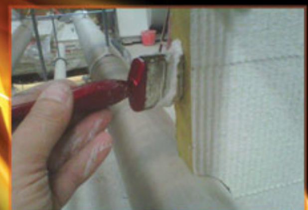
Buttering Up The Edges of The Intubatt